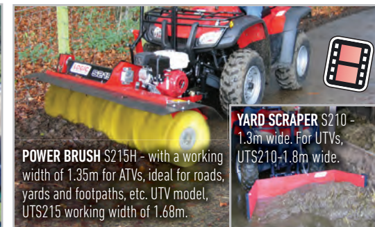
POWER BRUSH S215H - with a working width of 1.35m for ATVs, ideal for roads, yards and footpaths, etc. UTV model, UTS215 working width of 1.68m.