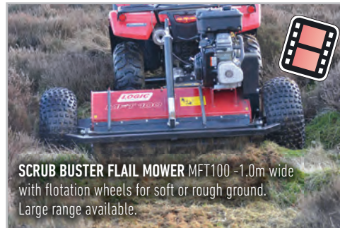
SCRUB BUSTER FLAIL MOWER MFT100 - 1.0m wide with flotation wheels for soft or rough ground. Large range available.