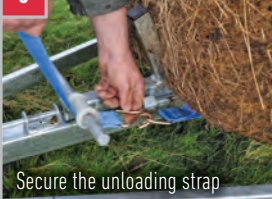
6 Secure the unloading strap