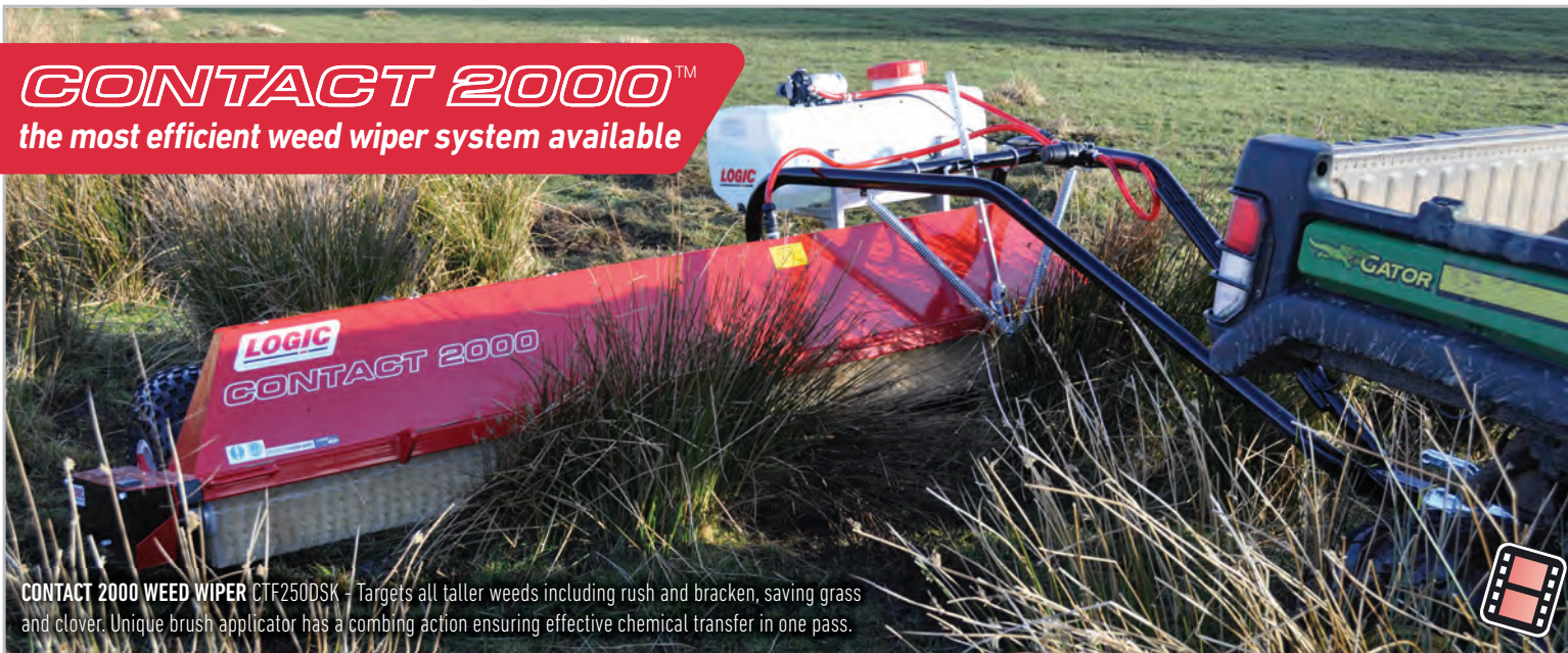
CONTACT 2000 WEED WIPER CTF250DSK - Targets all taller weeds including rush and bracken, saving grass and clover. Unique brush applicator has a combing action ensuring effective chemical transfer in one pass.