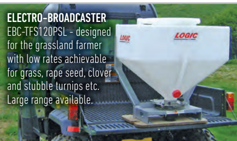
ELECTRO-BROADCASTER EBC-TFS120PSL - designed for the grassland farmer with low rates achievable for grass, rape seed, clover and stubble turnips etc. Large range available.