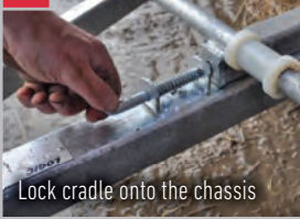
4 Lock cradle onto the chassis