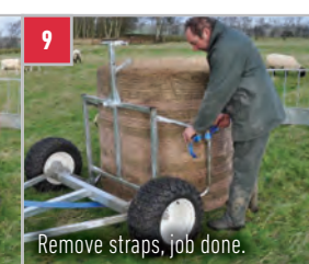
9 Remove straps, job done.