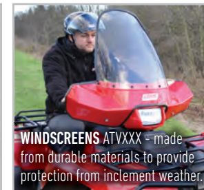
WINDSCREENS ATVXXX - made from durable materials to provide protection from inclement weather.