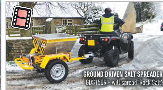
GROUND DRIVEN SALT SPREADER GDS150R - will spread 'Rock Salt'.