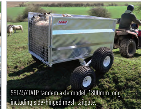
SST457TATP tandem axle model, 1800mm long including side-hinged mesh tailgate.

LOGIC LIVESTOCK TRAILERS are the result of innovative manufacturing techniques to provide a unique balance of strength with minimum unladen weight for durability and fuel economy for the towing vehicle. They feature an all-welded monocoque construction, galvanised for long term protection, bolt-in stub axles for ease of replacement, bead-lock wheel rims for added safety, top quality wheels and tyres and swivel hitch for Health & Safety compliance.