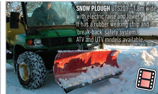
SNOW PLOUGH UTS201 - 1.8m wide with electric raise and lower. It has a rubber wearing strip and 'break-back' safety system. ATV and UTV models available.