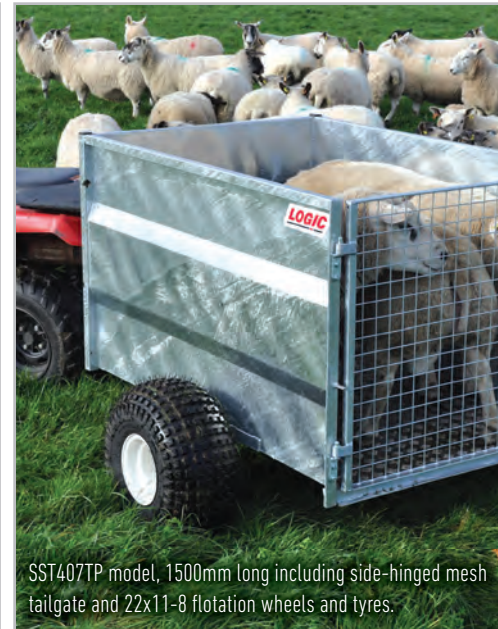
SST407TP model, 1500mm long including side-hinged mesh tailgate and 22x11-8 flotation wheels and tyres.