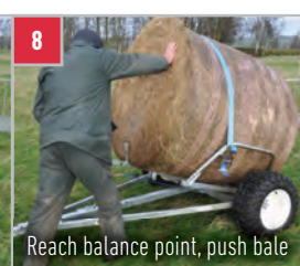
8 Reach balance point, push bale