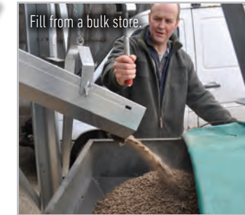
Fill from a bulk store.

Once the calibration has been completed, which takes about 5 minutes, the operator knows how much is being dropped in each pile. Thereafter the drop counter will record how many drops have been given in any one batch to calculate the total amount fed. After that it is a question of maintaining a forward speed that will give the required spacing between heaps to suit the type of livestock being fed.