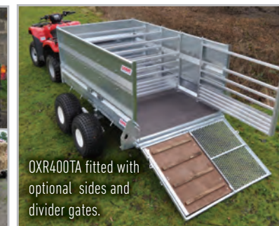
OXR400TA fitted with optional sides and divider gates.