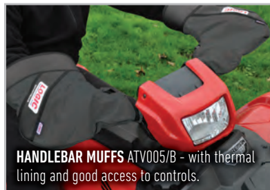
HANDLEBAR MUFFS ATV005/B - with thermal lining and good access to controls.