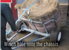
3 Winch bale onto the chassis