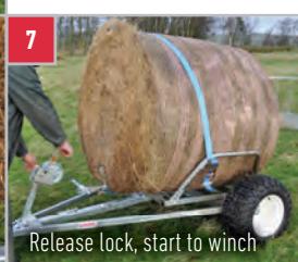
7 Release lock, start to winch

Ideal for livestock farms or equestrian units where one person can safely carry bales, towed by any suitable vehicle.