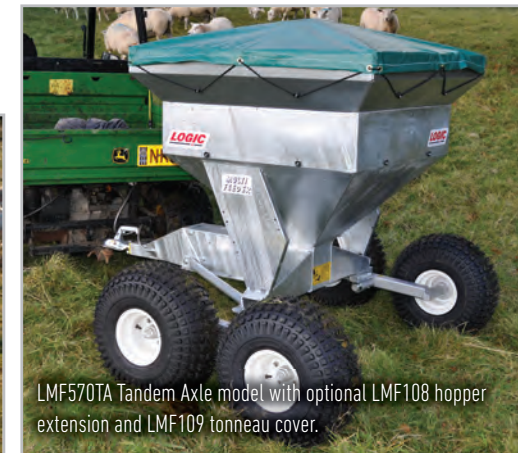
LMF570TA Tandem Axle model with optional LMF108 hopper extension and LMF109 tonneau cover.

Designed and manufactured in the UK to provide top quality equipment at outstanding value for money