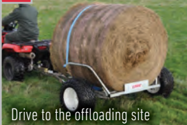
5 Drive to the offloading site