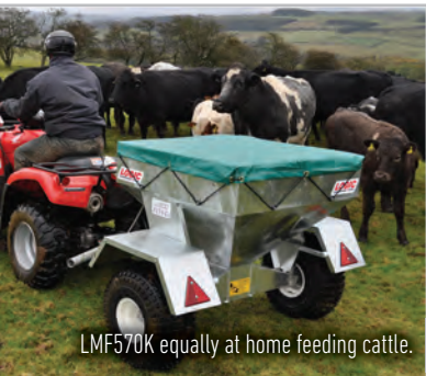
LMF570K equally at home feeding cattle.