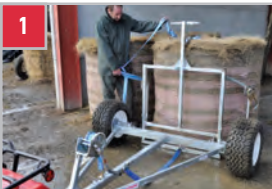
1 Back up to bale, secure strap