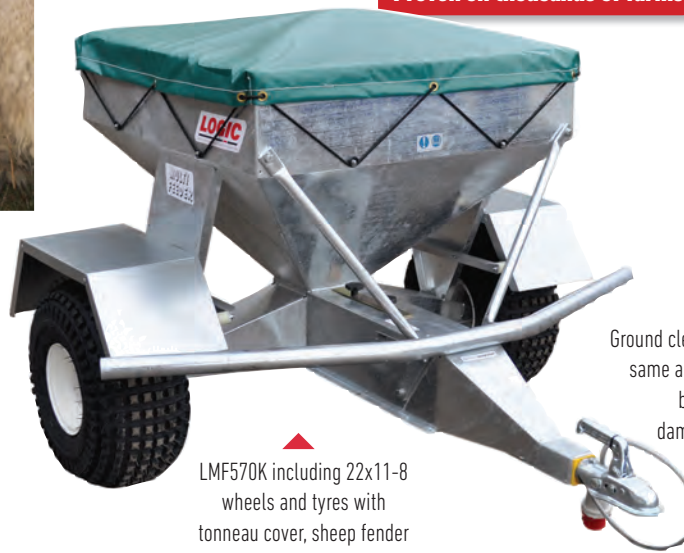
LMF570K including 22x11-8 wheels and tyres with tonneau cover, sheep fender and mudguards.