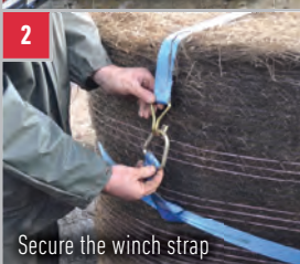
2 Secure the winch strap