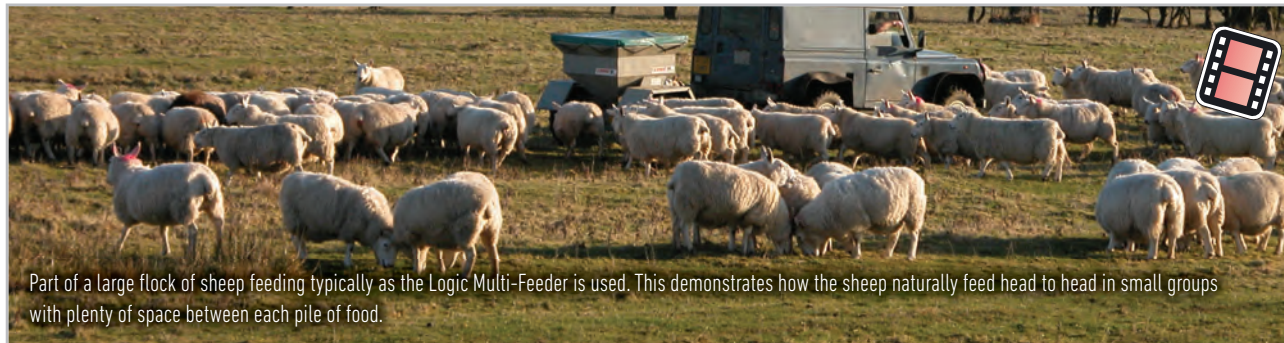
Part of a large flock of sheep feeding typically as the Logic Multi-Feeder is used. This demonstrates how the sheep naturally feed head to head in small groups with plenty of space between each pile of food.