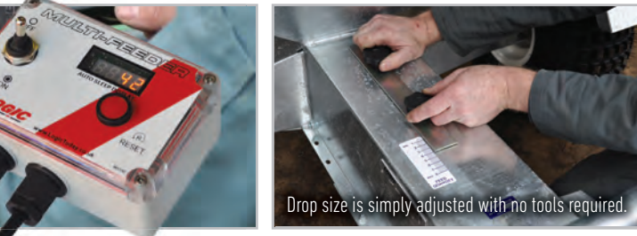
Drop size is simply adjusted with no tools required.

Once the calibration has been completed, which takes about 5 minutes, the operator knows how much is being dropped in each pile. Thereafter the drop counter will record how many drops have been given in any one batch to calculate the total amount fed. After that it is a question of maintaining a forward speed that will give the required spacing between heaps to suit the type of livestock being fed.