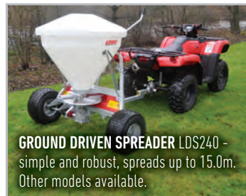
GROUND DRIVEN SPREADER LDS240 - simple and robust, spreads up to 15.0m. Other models available.