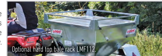
Optional hard top bale rack LMF112.

Ground clearance is important and is the same as a trailer, with no components below axle height that could be damaged by rocks, mud and snow.